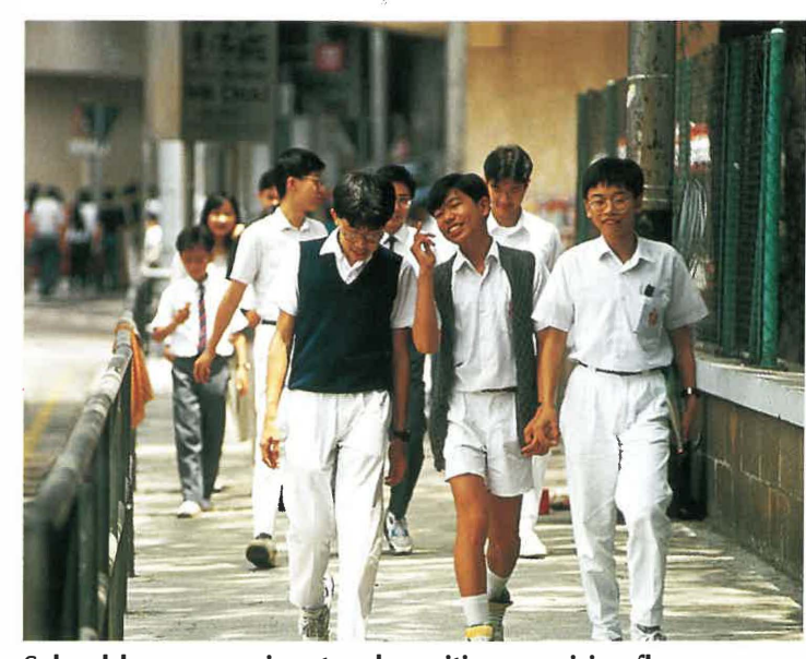
School-leavers are in a tough position requiring fluency in two, and sometimes three languages. 本港畢業生須兩語、甚至三語兼擅,甚為困難。