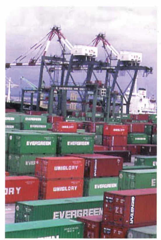
Taiwan has lost 70 per cent of its US exports to the Mainland. 台灣七成的輸美貿易已被中國大陸取代。

and computer software. Even if the Mainland products are of lower quality, Taiwan exporters will still have to