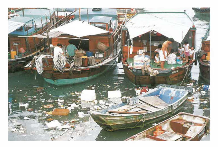
Making business opportunities out of environmental protection will boom. 環保能帶來無限商機

她說:「香港應專注於向內地轉移科技。內地擅於研究開發,但 『下游』工業的技術不甚了了。香港正可填補這空隙。」