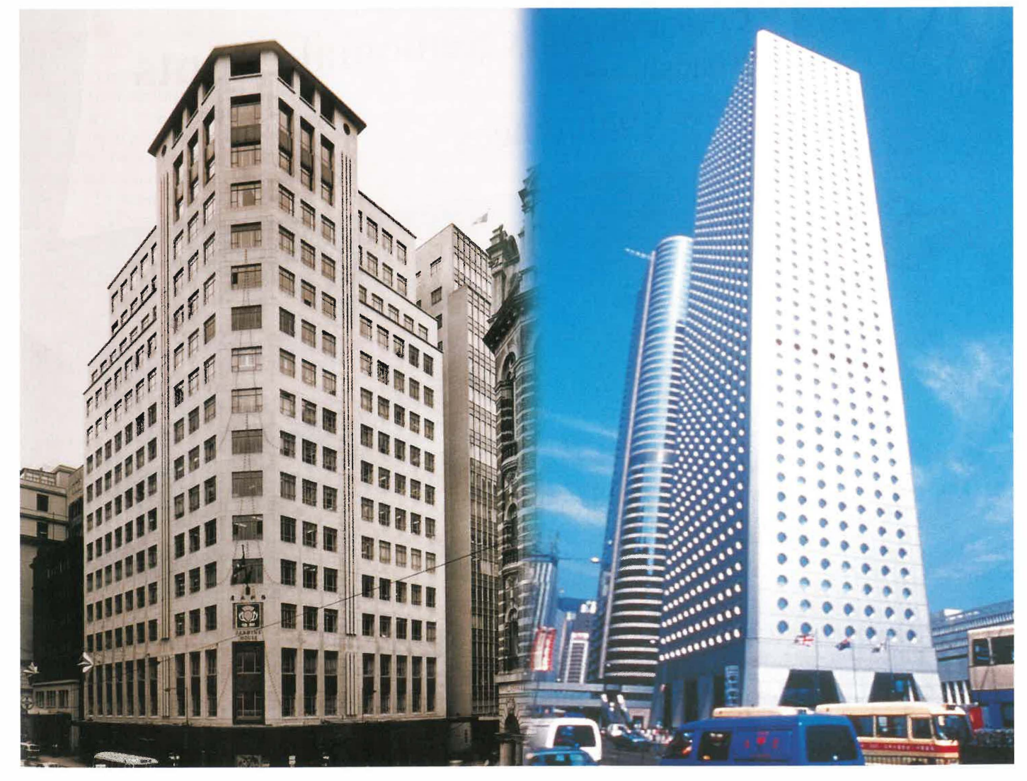
Then: Jardine Matheson's building in Central. 昔日位於中區的怡和大廈