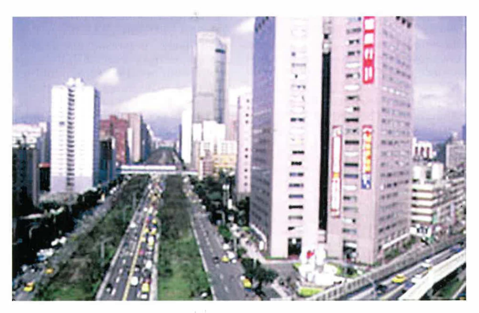
China's entry into WTO could boost trading across the Strait. 中國加入世貿有助海峽兩岸的貿易增長。

not just boost Taiwan's exports to China, but also encourage Taiwan to source materials on the Mainland. China's entry into WTO could boost trading across the Strait. In addition, China's institutionalising of its trading framework will reduce many