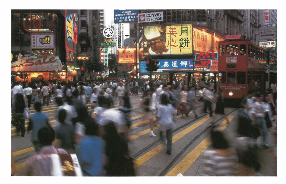
The international character of Hong Kong must be maintained. 香港的國際特性必須維持。