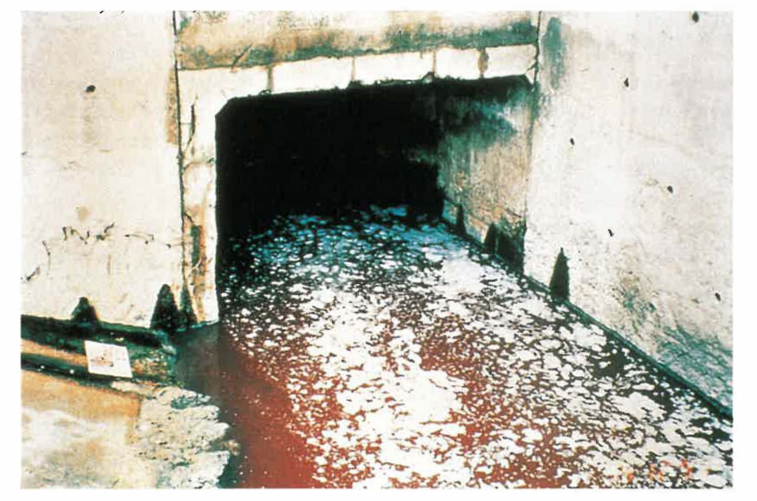
Every Hong Kong citizen deserves clearner air, water and food. 享有清新的空氣、食水和食物,是每位港人理所當然的權利。

Cost of doing business – Property prices 2. have gone down. So have hotel costs and food prices. Salaries and wages are experiencing a slight drop for the first time in many years, and worker productivity and ingenuity have received more attention. Comparisons with Singapore and Shanghai and other Southeast Asian countries have also helped Hong Kong people focus on the competition and erase complacency. While Hong Kong will never be a cheap place to do business, there is now a sense that we must add value and innovation to justify our high prices. There is still room to lower the cost of doing business, but at least the awareness of how this cost hurts Hong Kong's competitiveness is much more