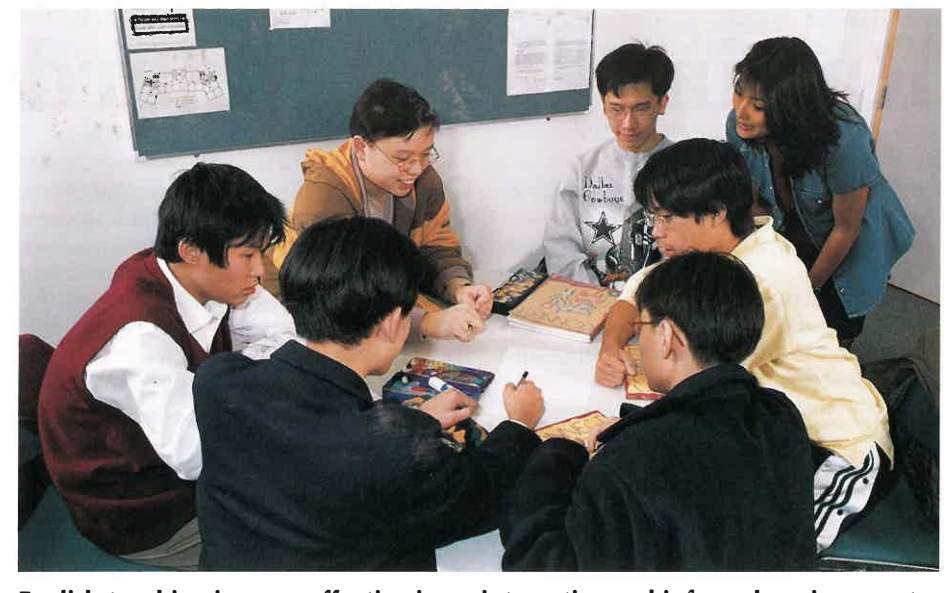
English teaching is more effective in an interactive and informal environment. 學生在互動和輕鬆的環境下學習英語,樂趣無窮。

seeking ways to improve the situation by studying countries whose education systems are successful at producing students who are fluent in a number of languages.