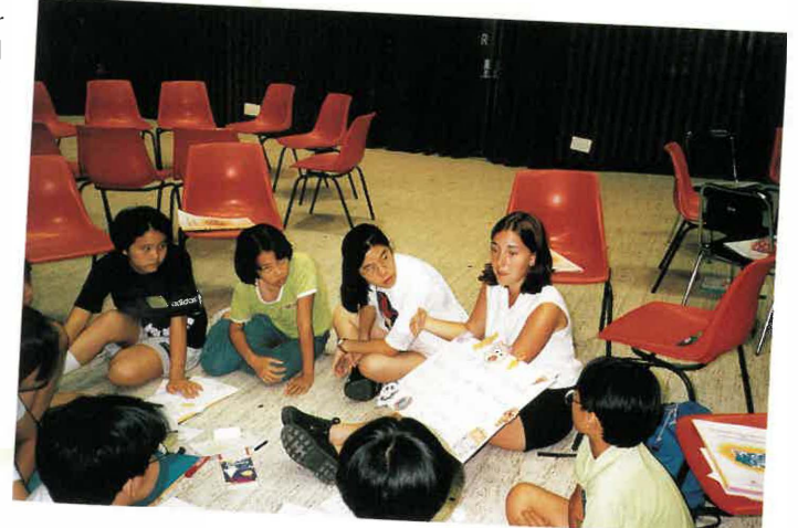
An English Language Teaching Assistant (ELTA) conducts 英語教學助理在課堂上與學生暢談。

are able to work this to their advantage. They concentrate purely on oral work and, with cooperation of the school involved, their classes are limited to around 10 students. In this way the students receive much more exposure to target language than they would in their regular crowded class of forty. Fluency, pronunciation and confidence