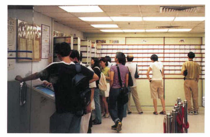
Job-seekers at the Labour Department's Employment Service Centre.

that there isn't an urgent need to recruit PRC nationals to work in Hong Kong at this time. However the Government and the