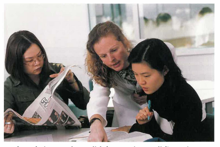
Students being taught English by a native English speaker. 學生專注聆聽外籍老師的講解。

"Kids may benefit from their lessons being taught in Cantonese academically – but it could be detrimental to English standards. The idea of bringing in native English speakers to counteract this decline is a good one," she said.