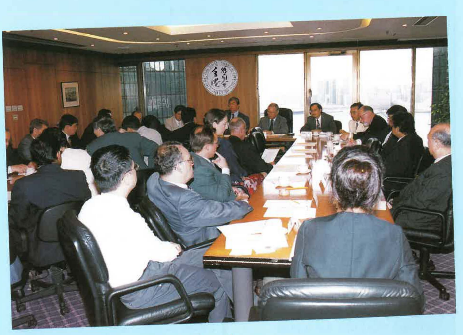
The delegation in the Chamber boardroom. 訪問團在理事會議室內與本會高層會晤。

t), Deputy Prime Minister of khstan, a 20-member to the Chamber on July 13 e Cook (right), Chairman of bjectives of the visit were to Hong Kong and ess partners in Hong Kong. 長托克巴耶夫(左)率20人官方/ 利(右)熱烈接待。該團此行旨在 夥伴。