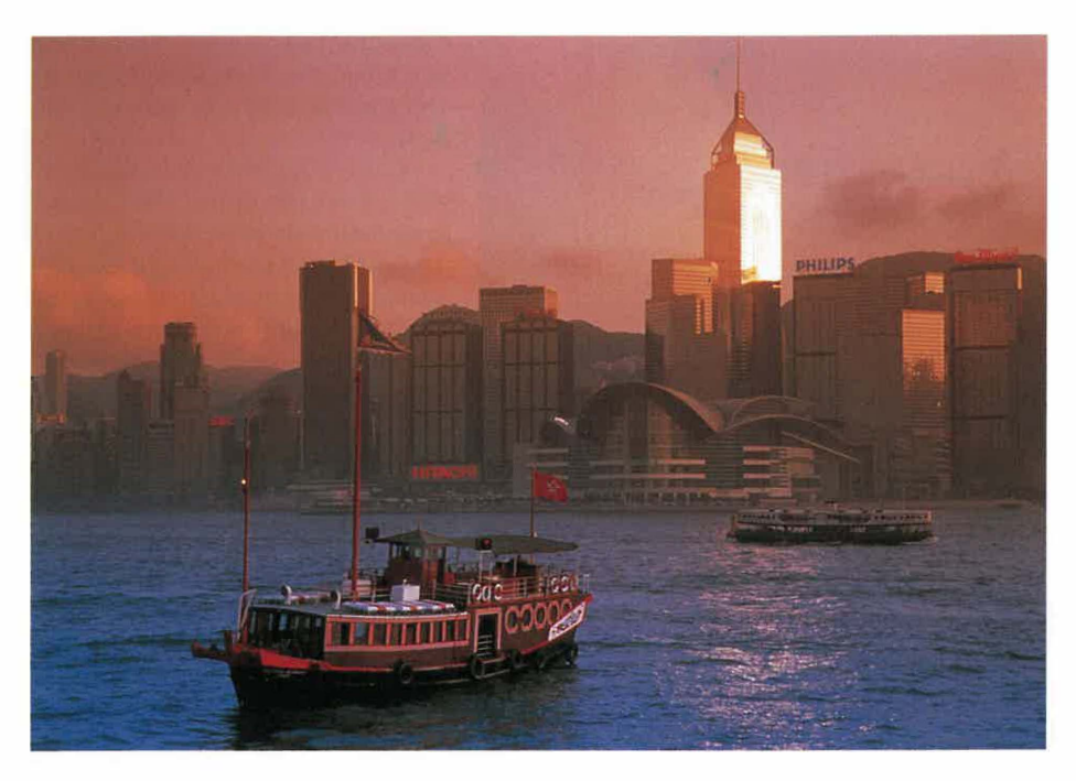
Crisis is good for Hong Kong in the long run. 長遠來說, 危機有助香港自我改善。

which proved to be pervasive in wealth generation, in the stock market, in how businesses grew, and in attitude formation among Hong Kong's citizens. A drop of 50 per cent in property prices